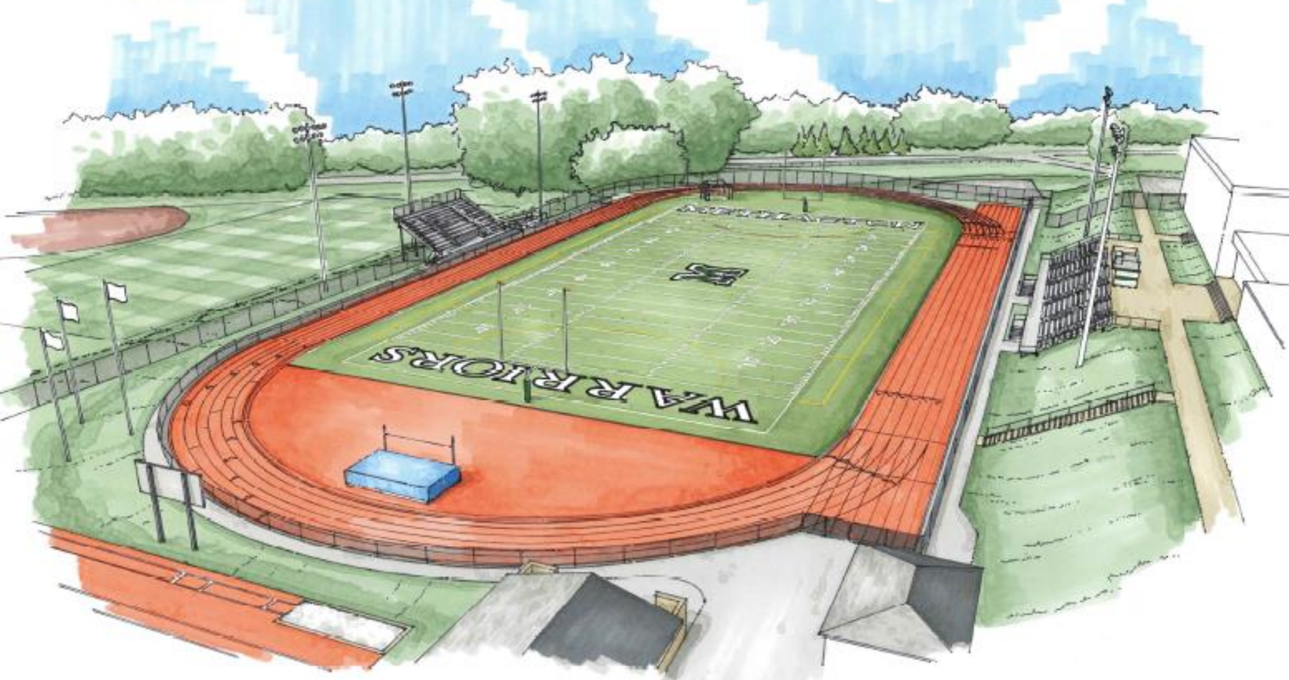
Methacton High School Campus Fields Project 1/12/2015